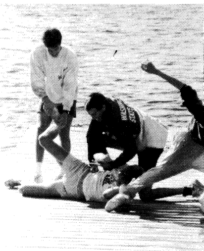
Preparing the sacrifice. Some things never change.