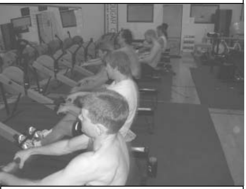
Our current erg room, Hollingbery Fieldhouse, racquetball court number 5.

Erging is now the foundation of our training and continues to facilitate the evolution of our sport. In fact, indoor rowing has evolved into its own sport with its own champions. Even teams like ours spend innumerable hours on the erg because of their awesome benefit to our rowing fitness. Ergs leave nowhere to run, and nowhere to hide. It is just you and the erg. No excuses. Our current winter workout schedule has us erging up to six days a week, and we will continue to rely heavily on them well into the spring season. Our coaches also use periodic erg test as a