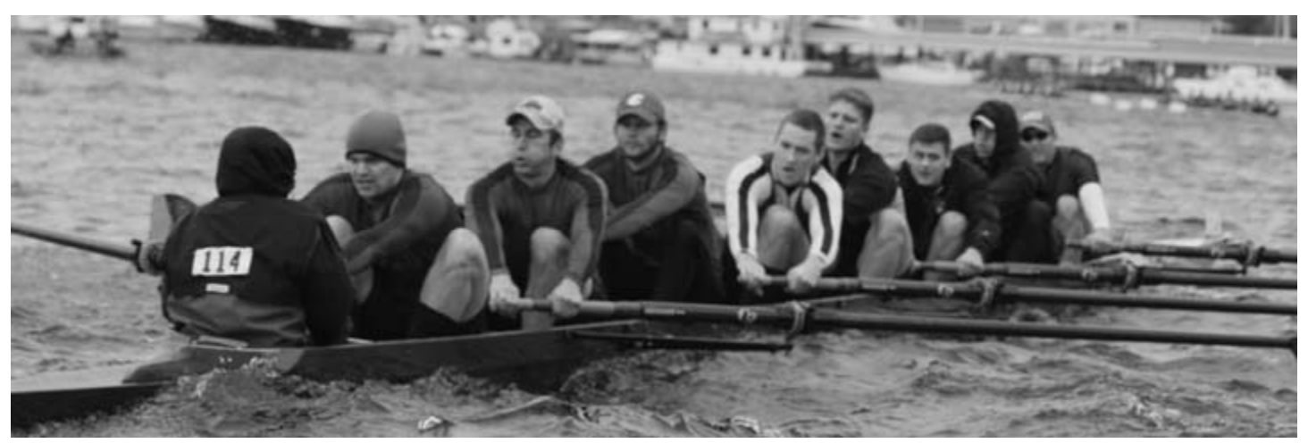
The WSU Men's Crew Alumni Eight Races at the Head of the Lake Regatta on November 11 in a newly refinished Defiant shell. Cougar Crew plans to enter an alumni eight each of the coming years to provide a connection to past rowers.