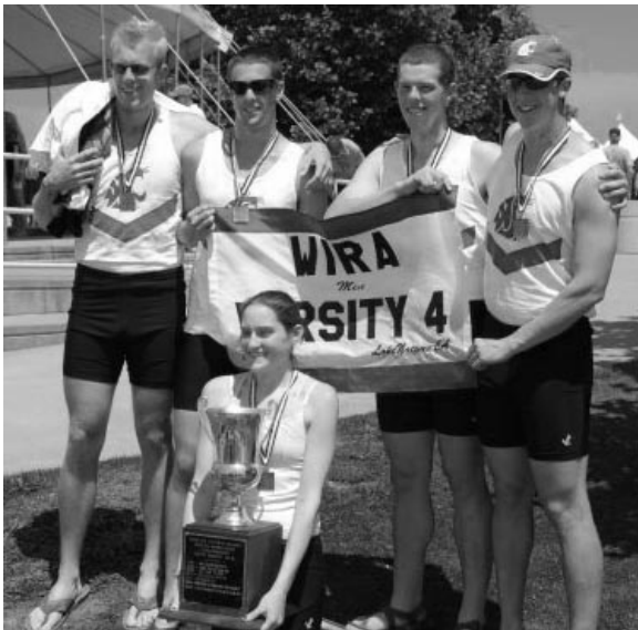
Above: The Varsity 4+ wins WIRA gold.

The highly anticipated duel between the Cougars and the Bulldogs of Gonzaga took place on the Snake River where just two years prior, the Varsity 8+ had won the race claiming the Fawley Cup Trophy. The Varsity 8+ faced off first and finished in 6:08.90, second place to the Bulldogs. In the JV 8 event, the Lights found their stride too little to late, and finished second in the race. After the upset the Cougar Novice had pulled off last year, the Novice 8A, looked to continue the trend, but finished behind the Bulldogs with a 6:38.20. The Novice 8B also finished behind Gonzaga, but set their best 2K time in the process. The next race for the Cougars will be their WIRA championships in California, With the success the crew has had this year, everyone is in high anticipation.