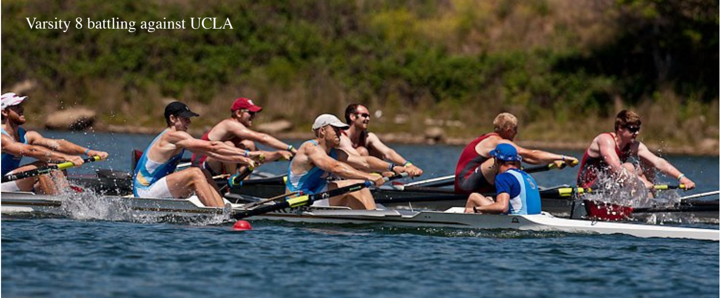
Varsity 8 battling against UCLA