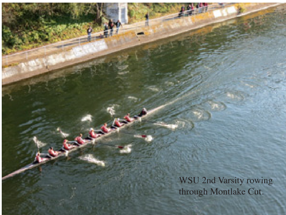
WSU 2nd Varsity rowing through Montlake Cut.