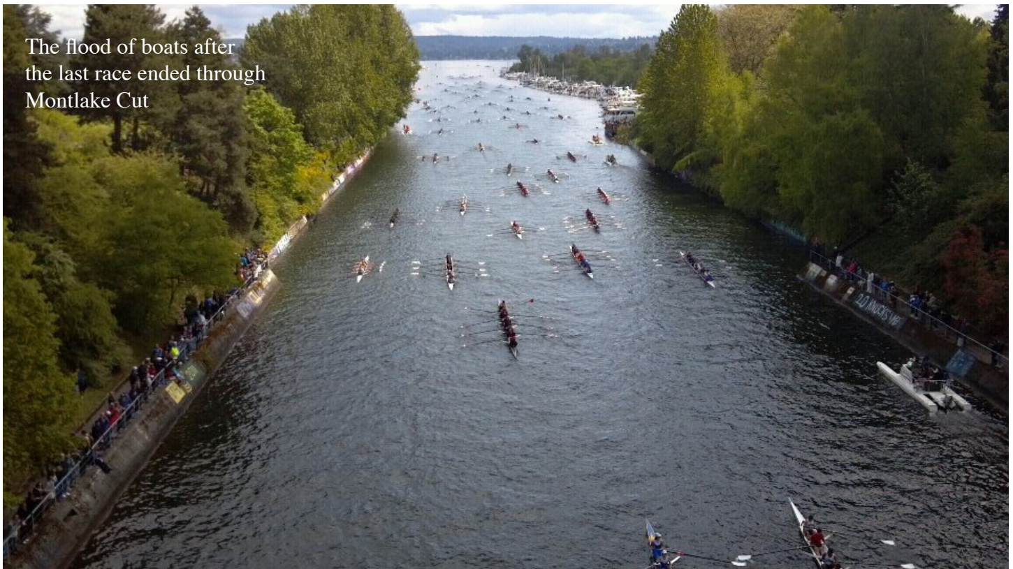
The flood of boats after the last race ended through Montlake Cut

In the Men's Varsity 4+ the University of Washington led the charge with their two entries. Oregon State University, Loyola Marymount University, Pocock Rowing Center and WSU stayed close for most of the race with the OSU Beavers crossing the line for third place followed by Pocock. The Cougars sprinted well and nearly passed LMU, but came across 0.4s too late with a time of 6:24.5.