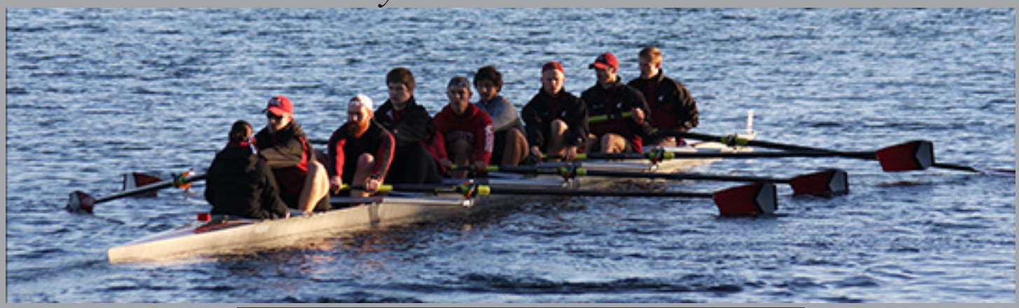
The varsity 8 warming up for their first race of the season.