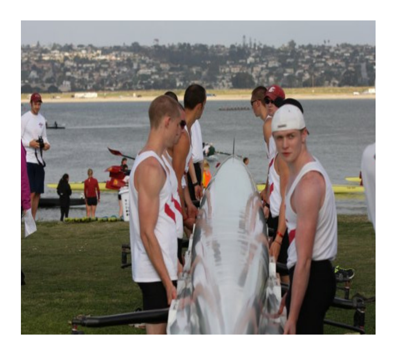
The Novice Men's 8+ with the Ken Struckmeyer, a Pocock Shell at the San Diego Crew Classic in spring 2013

The Cougs have made it to San Diego since the early days of the Crew Classic, even resorting to driving down some years. Besides the fun, as one of the earlier races in the spring it is a strong indicator of where the team stands up against other teams who compete at ACRA's. While the roster is smaller than in past years, the Cougs hope to use the Classic as launching point in preparation for later regattas, specifically WIRA's and ACRA's.