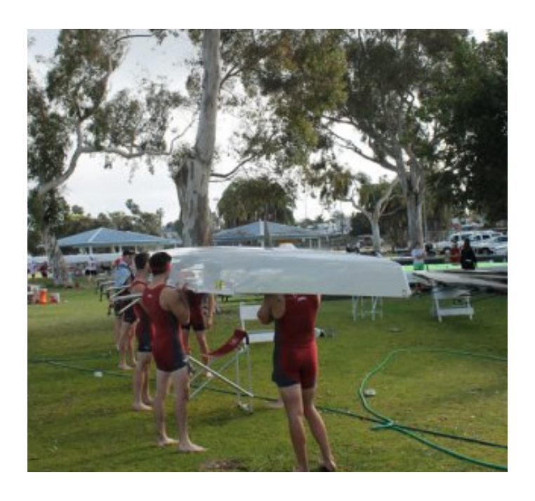
The JV 8 getting ready to wash the New Hudson 8+ at SDCC

Once again we would like to thank Ernie and Alice for their generous donation to help us reach San Diego, without the support of our alumni the spring season would look very different.