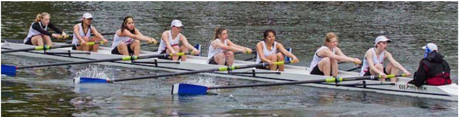
Above: Novice Mixed 8+

The Novice mixed 8+ came fourth in the W3V8+ event with an 8:18.24. The start was strong and they were even with Pacific University until they edged past about 1,100 meters into the race. Pacific University held WSU off and came in third, 5.94 seconds ahead. Pacific University was able to pull so far ahead because WSU continued at race pace throughout the entire race.