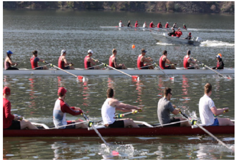
Above: Class Day winners (Seniors) take on two alumni boats in a 500 meter race after racing against Gonzaga