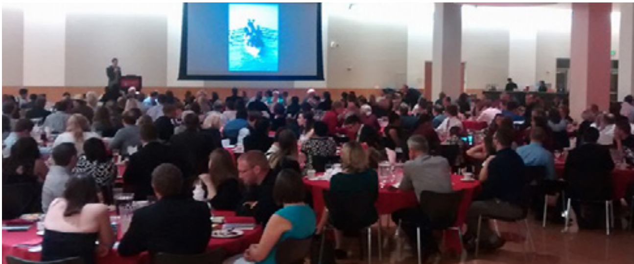
Left: View from the auction